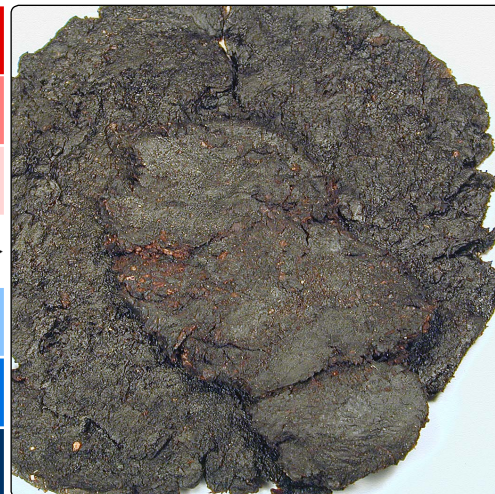
huáng jīng (Siberian Solomon Seal Rhizome, Polygonatum)