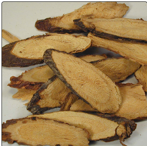
gān cǎo (Licorice Root)