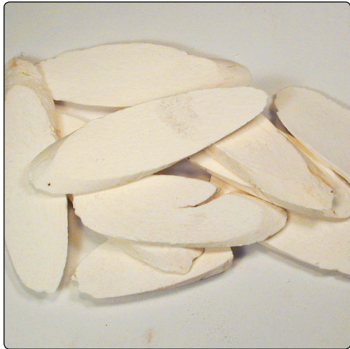
shān yao (Chinese Yam Rhizome, Dioscorea)

Radix Ginseng sweet, slightly bitter, slightly warm