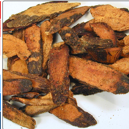
zhì gān cǎo (Honey Fried Licorice Root)