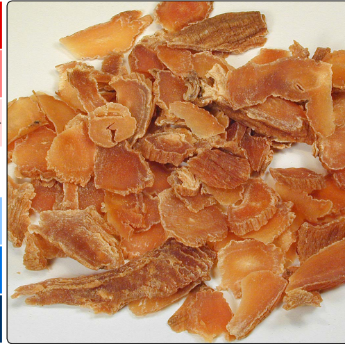
rén shēn (Ginseng Root)

Radix Astragali Membranacei sweet, slightly warm