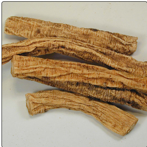
dǎng shēn (Codonopsis Root)