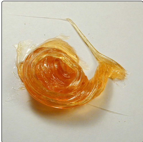
yí táng (Barley Malt Sugar, Maltose)

Radix Pseudostellariae sweet, slightly bitter, neutral