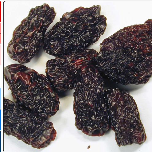
dà zǎo (Date, Jujube)

Rhizoma Atractylodis Macrocephalae bitter, sweet, warm