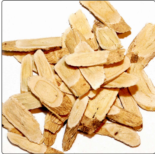
huáng qí (Astragalus)