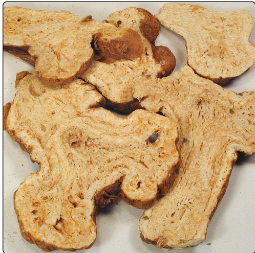
bái zhú (White Atractylodes Rhizome)