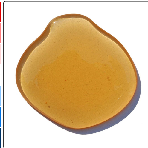
fēng mì (Honey)

Radix Codonopsitis Pilosulae sweet, neutral